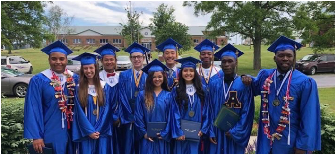
Class of 2018