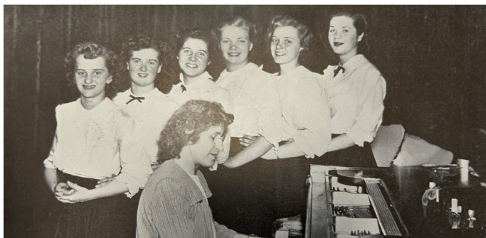
1948 - The Mello-Ettes from 1948!