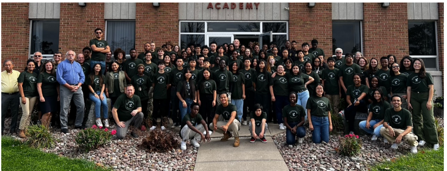
Students and Staff - 2022-2023 School Year