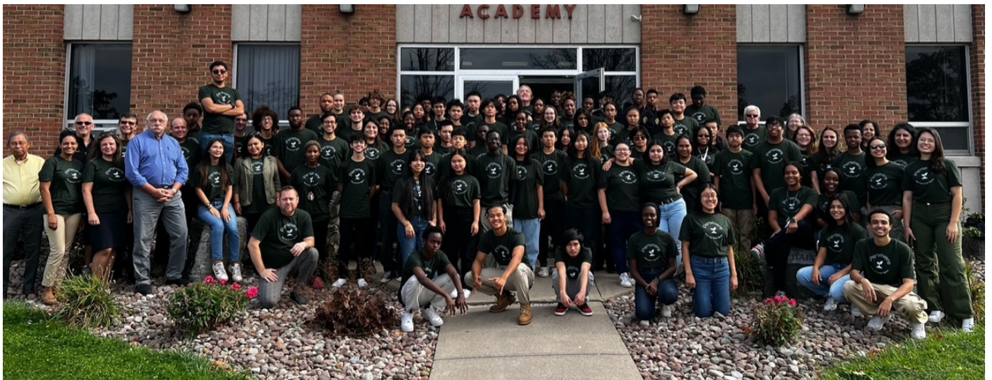
Students and Staff - 2022-2023 School Year